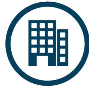
Back to Work Sooner