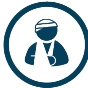
Reduces Complications & Prolonged Sickness